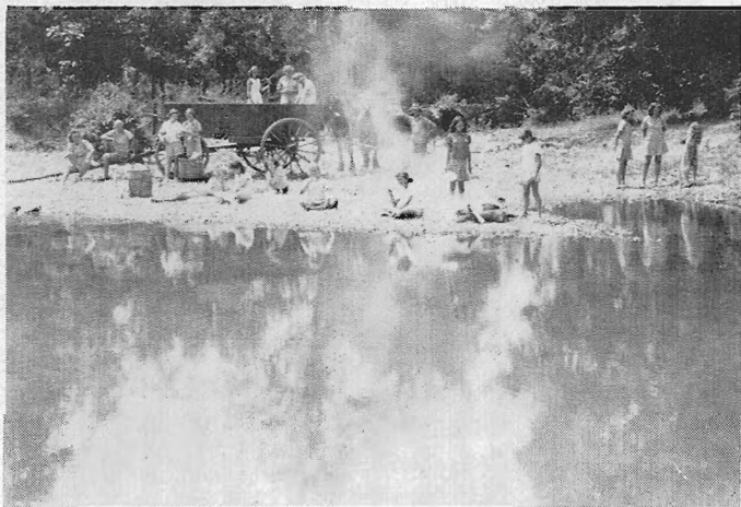
—Supper by the clear waters of the swimming pool.